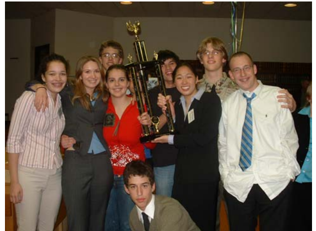
University Prep accepts their State Champion trophy

When they moved on to represent Washington at the national competition in Charlotte, NC their hard work and dedication won them 10th place overall and gave the rest of the nation a taste of the amazing things the youth of our state have to offer.