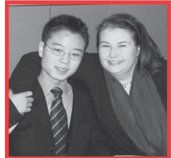
Coaches and Advisors give countless hours each year working with students in Y&G programs.

This was a great kickoff for both the Youth Legislature and Mock Trial programs. Thank you to all of you who participated!