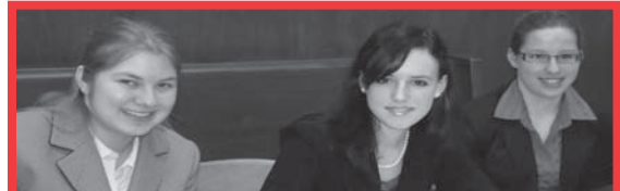
Whatcom County students prepare for trial

Black Hills High School Garfield High School Marysville-Pilchuck High School Mt. Spokane High School Stilligumish Valley School